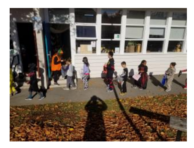
6 - Trick or treating is so much fun at school