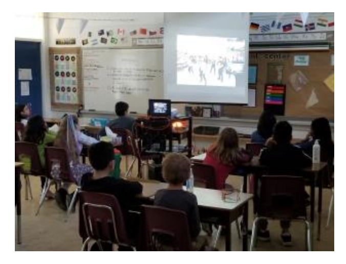
3 - Virtual Assembly