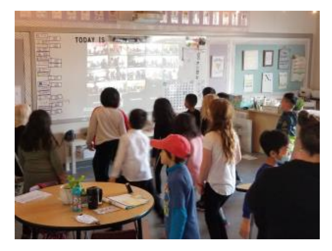
4 - Dancing to the Monster Mash