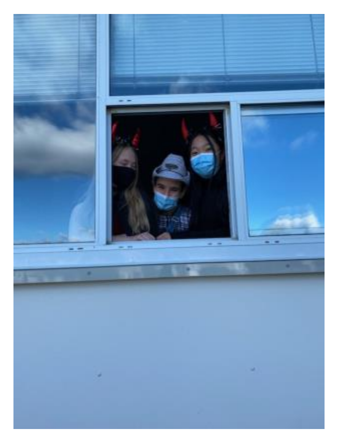
8 - watching from a safe distance