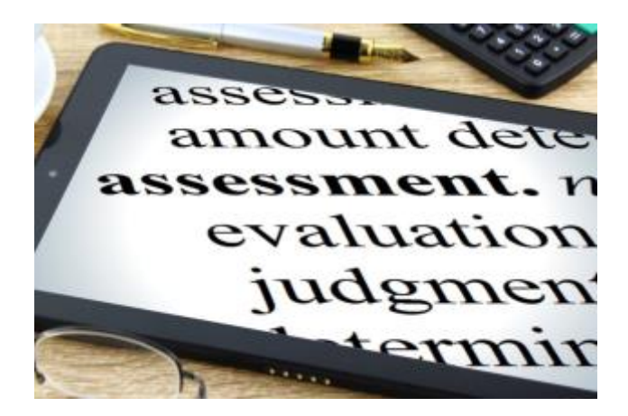
1 - Assessment and Reporting